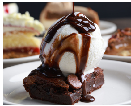
Brownie Delight Warm chunky chocolate brownie served with a scoop of vanilla ice cream, drizzled with chocolate syrup. 6.99