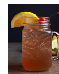
Tomahawk Tea American Born Original® Moonshine, Vodka, Gin, Triple Sec, Cranberry Juice, Fat Tuesday's Sweet & Sour, & Coke.