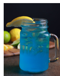
Blue Lagoon Blueberry Vodka, Blue Curacao, Lemon & Lime Juices, and Soda.