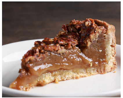
Kentucky Bourbon Pecan Pie Large buttery caramel pecans layered on a rich, gooey filling with a hint of Kentucky Bourbon, all resting in an all-butter short pastry crust. 6.99