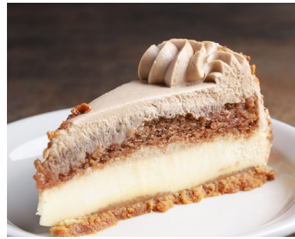
Sweet Potato Maple Cheesecake Cinnamon cheesecake baked on a buttery graham cracker crust, topped with moist sweet potato spice cake and iced with cream cheese maple icing. 6.99