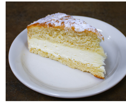
Lemon Italian Cream Cake A winning combination of yellow cake layers filled with Italian lemon cream, made from real mascarpone cheese, finished with vanilla cake crumb on the sides, and lightly dusted with confectioners' sugar. 6.99