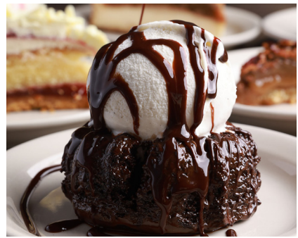
Chocolate Molten Cake Warm chocolate cake drenched with dark chocolate. Topped with vanilla ice cream. 6.99