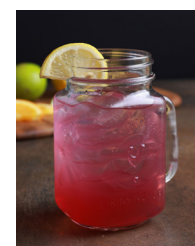
Desert Flower ABSOLUT® Vodka, Malibu® Coconut Rum, Lemon and Lime Juices, and Monin® Desert Pear.