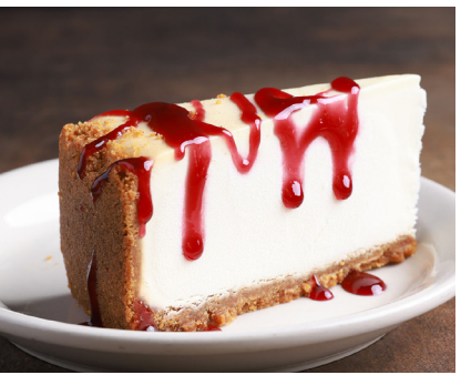
Original NY Cheesecake Deliciously decadent cheesecake drizzled with your choice of caramel, raspberry or chocolate. 6.99