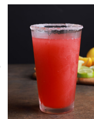
Patrón Straw 'Rita Patrón® Silver Tequila, Patrón® Citrónge Lime, Strawberry Puree & Citrus Juices.