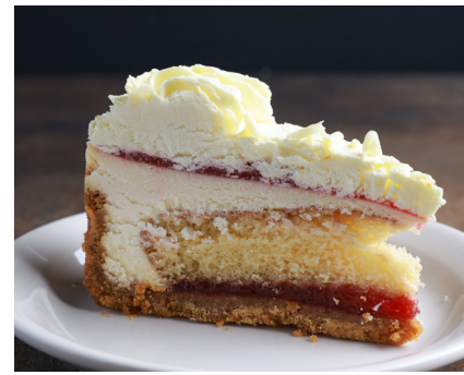
Lemon Raspberry Cheesecake Lemon Raspberry Layered Cheesecake baked in a buttery graham cracker crust, topped with more raspberry jam and lemon mousse. 6.99