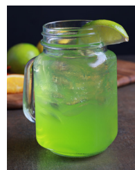
Fishin' Hole Citrus Vodka, Melon Liqueur, Lemon & Lime Juices and Sprite