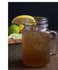
Redneck Ice Tea Delicious mix of Rum, Vodka and Gin with our signature Redneck Tea mix.