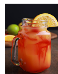
Sunset Punch Bacardi® Silver Rum, Malibu® Coconut Rum, Peach Schnapps, Mango Puree, Orange Juice and Grenadine.