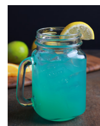
Hypnotized Donkey Hponitiq®, Malibu® Coconut Rum, Blue Curacao, Orange Juice, Lemon and Lime Juices and Soda.