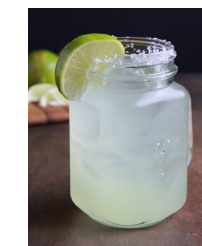
Ranch Hand 'Rita Tequila, Triple Sec, and Fresh Lime Sour.