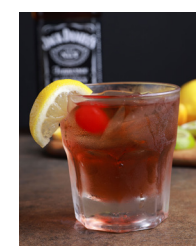
Dusk Till Dawn Jack Daniels® Whiskey, Lemon Juice, Cane Sugar and Merlot.