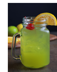
Trash Can Punch Captain Morgan® Spiced Rum, DeKuyper® Banana Liqueur, Melon Liqueur, Lemon and Lime Juices, and Pineapple Juice.