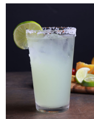
Patrón 'Rita Patrón® Silver Tequila, Patrón® Citrónge Lime & Citrus Juices.