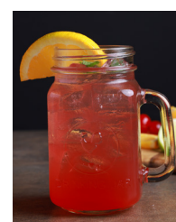
Peach Berry Sangria ABSOLUT® Vodka, Rosé Sangria, Monin® White Peach, Strawberry Puree and Fresh Lime Sour.